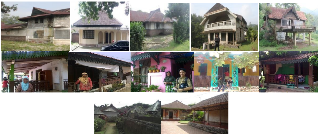
Figuer 1. Housing in 1980 s – 1900 s