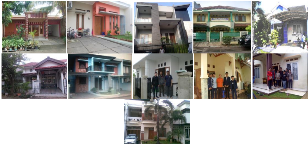
Figure 3. Housing Type in 2000s – 2012s