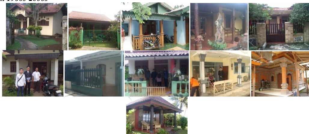
Figure 2. Housing type in 1900s-2000s